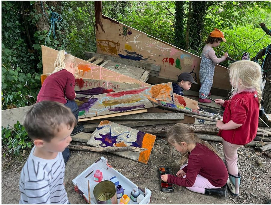
Friends of Laddingford School