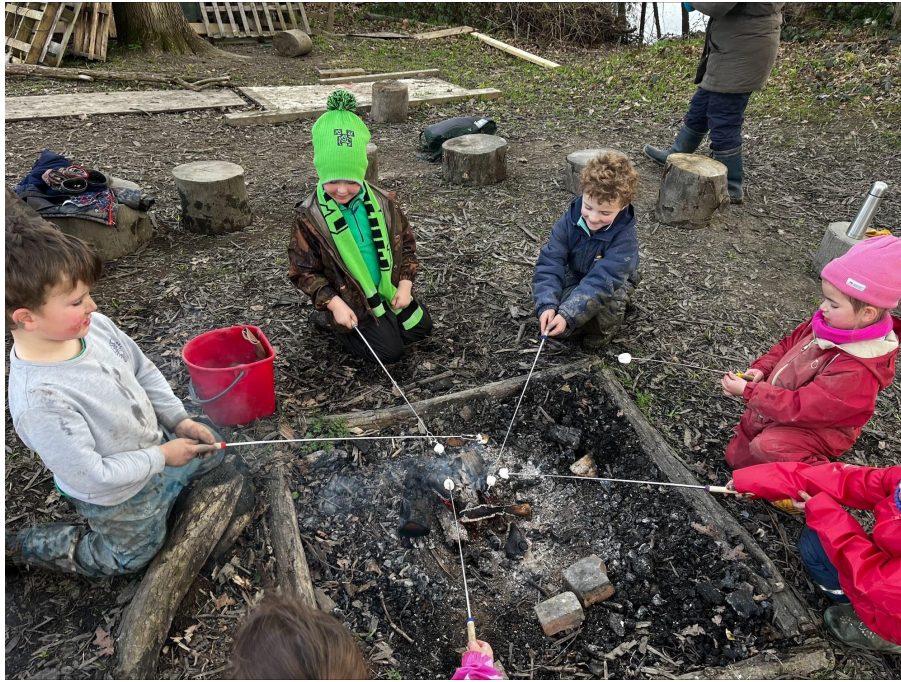
Friends of Laddingford School