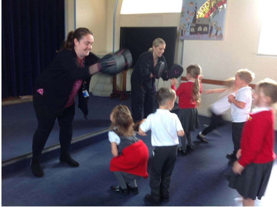
Spotlight on Jazz Class!